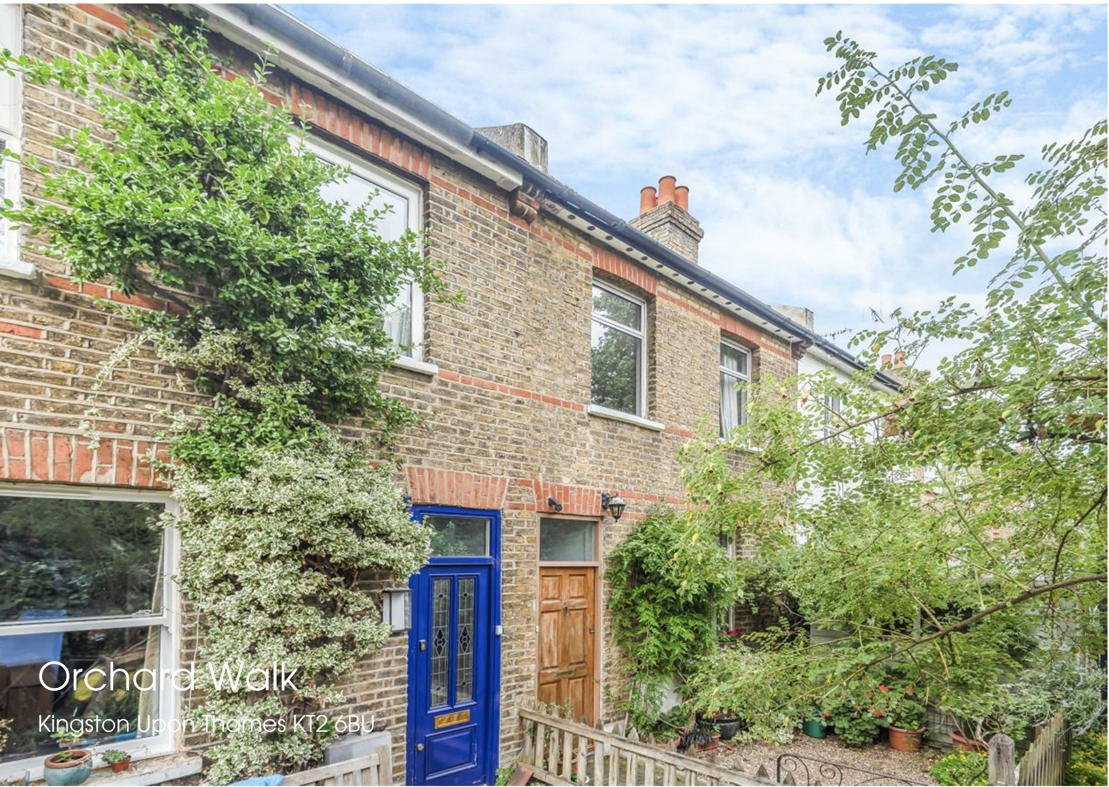
Orchard Walk Kingston Upon Thames KT2 6BU